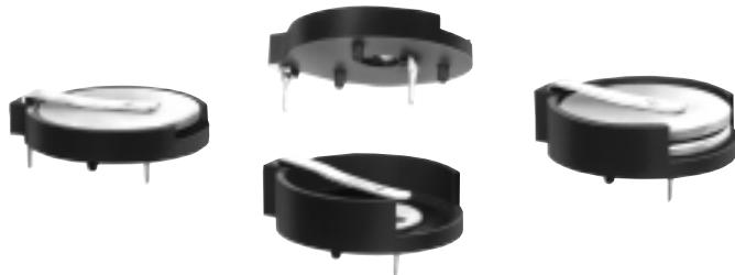
SINGLE CELL HOLDER (3-VOLT)